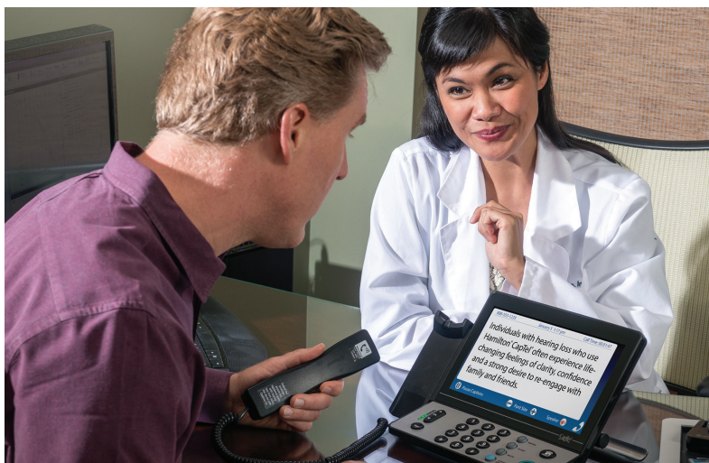
If a patient has difficulty hearing over the phone, they may be an ideal candidate for a no-cost* Hamilton® CapTel® captioned phone. Professionals simply complete and sign the Certification Form, verifying the patient's hearing loss.