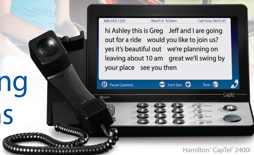
Hamilton® CapTel® 2400i

There's no need to let hearing loss impact the connections that matter most in your patients' lives. Whether it's with family, friends, business contacts or health care professionals, it's their ability to connect, communicate and collaborate with others that makes their lives whole.